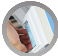
Easy release side rails