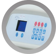
Nurse control panel with integrated weight scale