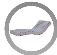
Anti bedsore mattress