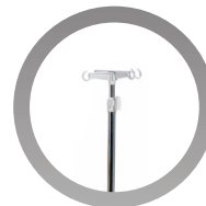
IV pole with four hooks